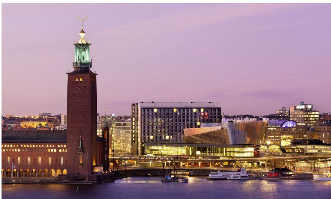
Stockholm City Hall, the venue of the Congress reception, and Stockholm Waterfront Congress Centre

The Congress will attract leading aviation experts, engineers, scientist and Ph.D. students from all over the world.